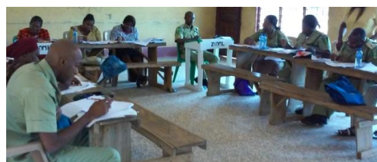
Participants hard at work on final write-up of comic books