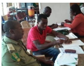
Interviewing for biographies