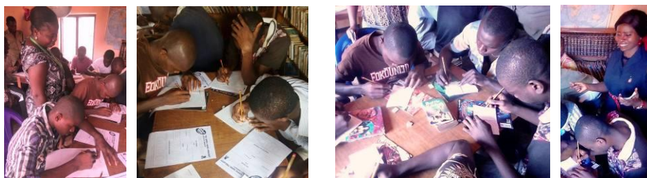
Creating comic books to develop literacy skills