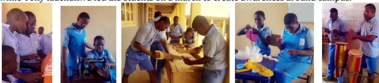
Centre for Academic and Vocational Training of Special Needs Children (CAVTSN) celebrating World Book Day with creative activities