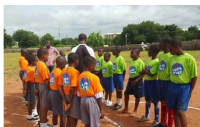
The two teams lined up