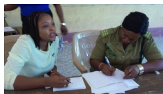
Interviewing for pocket biographies