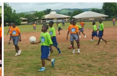
And the match is on!