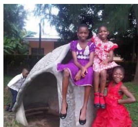
Posing on the tortoise