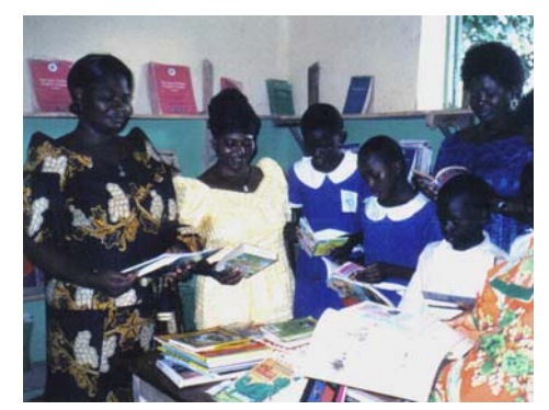
Books donated by PULA are delivered to the CPS Obimo school library in July.