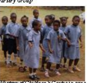
History of Children's Centre in song