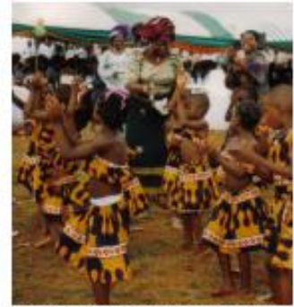
Dance by NALW Nursey Group