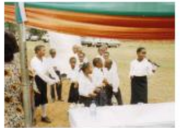
Welcome song by Chillren's Centre group