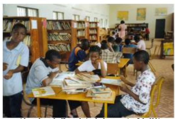
A busy day at the library during the longwacation, July 2004